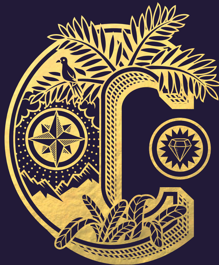
Logo - Sign on Dark Navy background