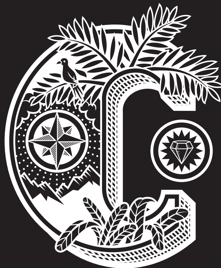
B/W Logo - Sign on Black background