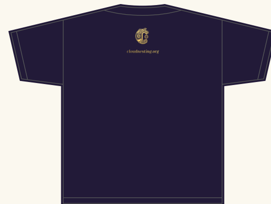
T-Shirt Concepts Front/Back Side