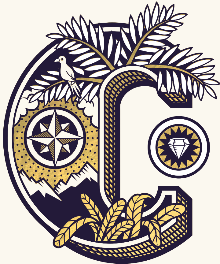
Logo - Sign only