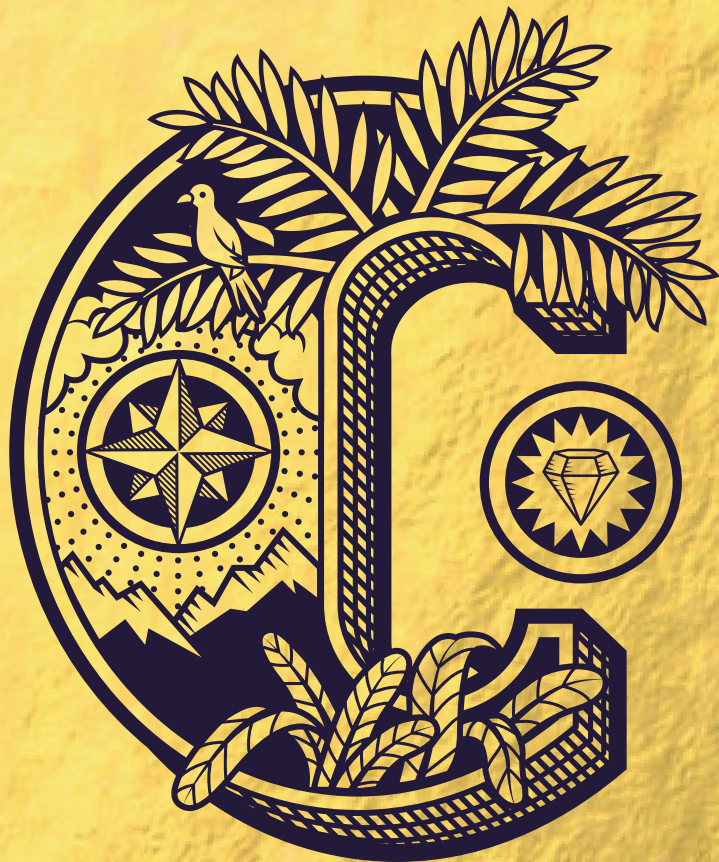
Logo - Sign on Gold texture