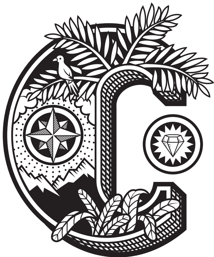
B/W Logo - Sign on White background